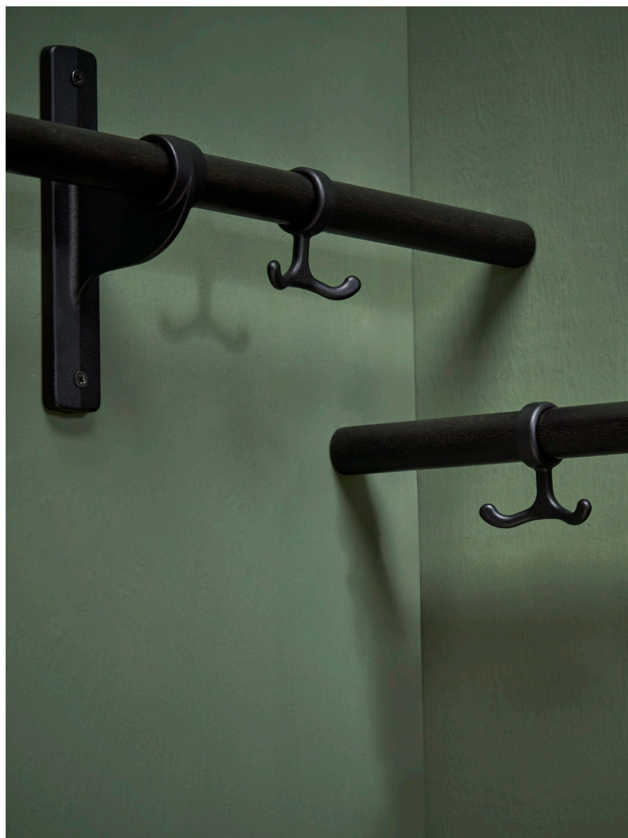
Nostalg hook strip